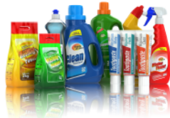
Home Care & Cleaning products