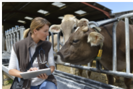
Animal Care & Veterinary products