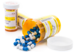
Pharmaceutical products, Body care & Medical Tests

Reduce the complexity, avoid obsolete labels, save time and money.