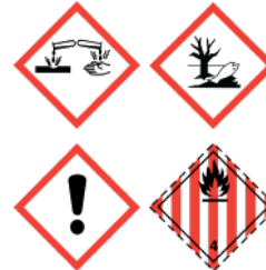
GHS & Chemical products